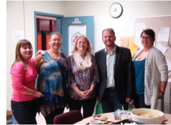
Jo(e) Ideas for Business and LinkedIn Learning Workshop Oct 15 th